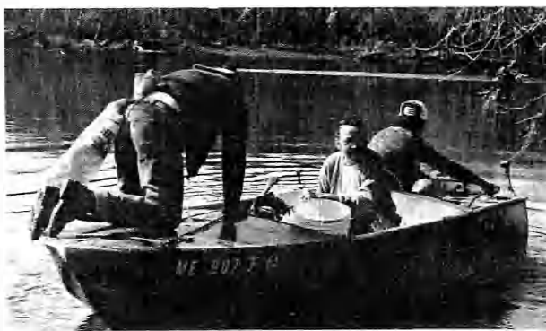
SHOVING OFF - Penobscot tribal members, with bags and buckets to fill, head up the Penobscot River in search of fiddlehead ferns. The delicacy is plentiful on the river's islands, where Indians only are allowed to pick them. May is fiddlehead month.