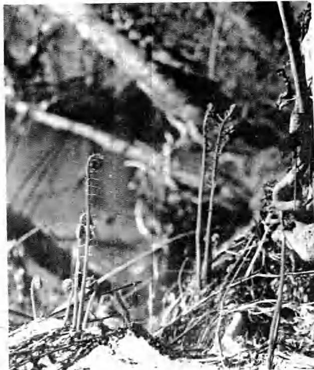
Behold the fiddlehead.

The communities, committees and boards that are dominated by a single power structure will breed jealousy, frustration, hatred, discouragement.