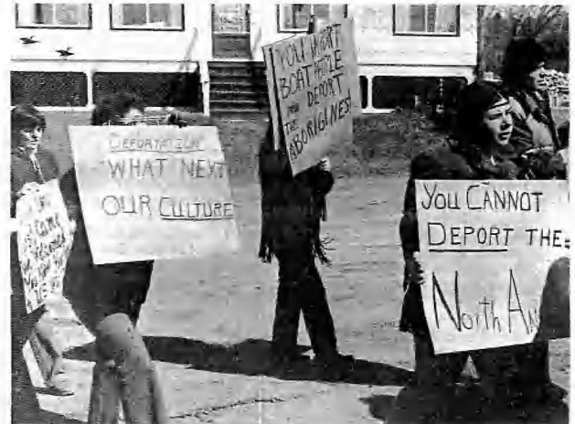
On the picket line, Maliseets walk back and forth over the Maine-Canadian border near Fort Fairfield.