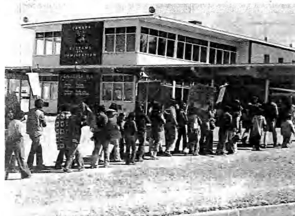
Demonstrators approaching the Canadian customs building at Andover, New Brunswick — opposite Fort Fairfield, Maine.