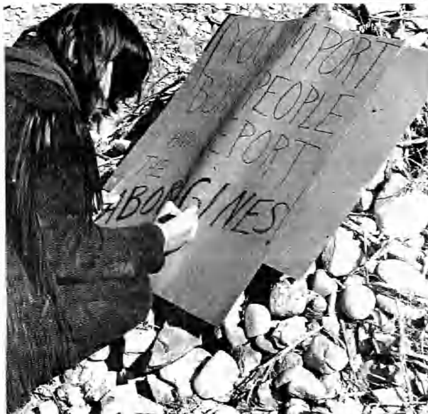
A young Indian woman makes poster for U.S.-Canadian border protest last month. Her sign reads: "You import boat people and export aborigines!"