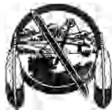
BLACK HILLS ALLIANCE

6. The Tennessee Valley Authority has reported that it will use at least 675 gallons of water per minute for its mineral development. This destroys the natural aquifers (an aquifer is an underground water bearing rock formation) of the area mined. T.V.A. admits that one of its mines will dewater the Lakota Nation's aquifer in 35 years or less.